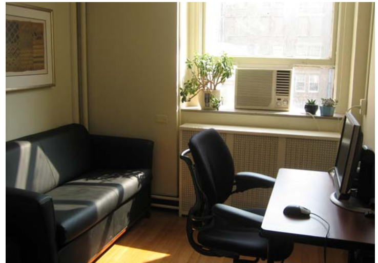
Above is a picture of one of our three new interview and experimental rooms; it is equipped with computers, brand new furniture, and an internet connection.

Our new space allows better interaction for our staff and provides a more comfortable setting for study participants. We hope this space makes for a more enjoyable experience in the study.