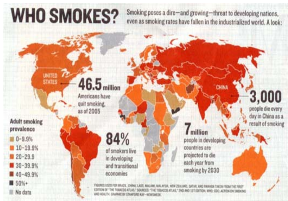
The map to the to the right was obtained from Newsweek July 9, 2007. Pg 57.

Some of these facts may surprise you. For instance, the smoking prevalence in Asia (30-39%) is higher than in any other continent. In terms of individual countries, the highest smoking rates (50%+) were observed in Yemen and The Republic of Guinea. On this side of the Globe in North and South America, Chile ranks as the country with the highest smoking rate (40-49%).